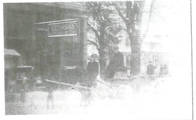
Thomas Market in 1914 (above). Thomas Market is now home to Crawford Insurance Group and When Pigs Fly.