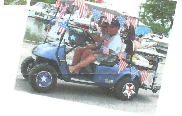
Salute to the Laguna Yacht Club. Having a history of fun, food, and friendship at the Huron Lagoons Marina, this group dissolved in 2022 and donated over $1,100 to the Huron Historical Society. Much appreciated.